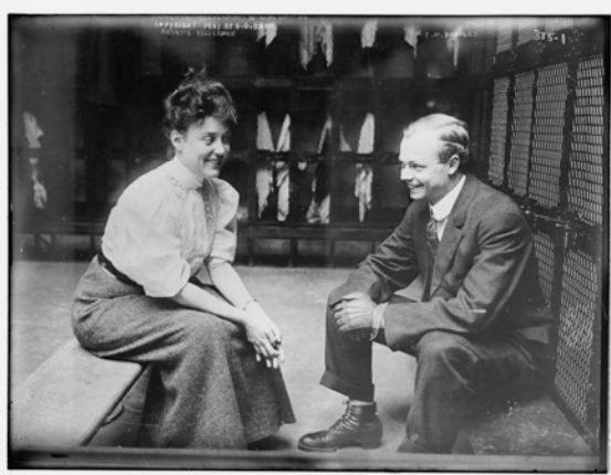
Above, Annette Kellerman with Charles Daniels. At right, Duke Kahanamoku.