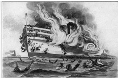
AWFUL SCENES—SHOWING WOMEN AND CHILDREN JUMPING OFF THE STEAMBOAT BEFORE SHE WAS BEACHED ON THE ISLAND. THEY FLED FROM THE FIRE TO CERTAIN DEATH.

The dawn of the 20 th Century was when sea bathing and swimming were just coming into vogue. The beach was where men and women could mingle and take a “moral holiday” from the sexual repression of the Victorian Era. But as people flocked to the beach to enjoy the pleasures of the sea, drowning rates soared. By 1900, over 9,000 Americans were drowning each year – a rate of over 14 per 100,000.